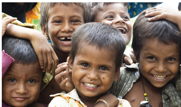
As Our Own As Our Own rescues vulnerable children from certain enslavement and exploitation and cares for them as our own. A contribution from Houston's First provided a lead gift in their Capital Campaign and funding for the launch of their Sparrows Nest campus.